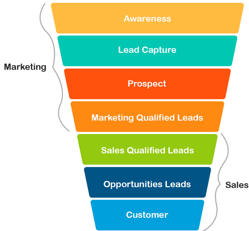
Figure 1 Creating a Lead Funnel

A lead funnel can be created as mentioned in the figure from creating awareness to capturing lead, prospect building and segregating MQLs. First four stages belong to the marketing while the bottom three approaches of the funnel belong to the sales; Sales Qualified Leads (SQLs), Opportunity Leads and Final Consumer.